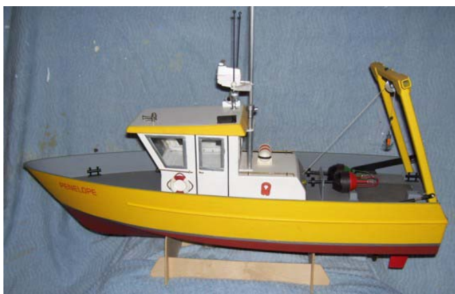
Caldercraft – Crick