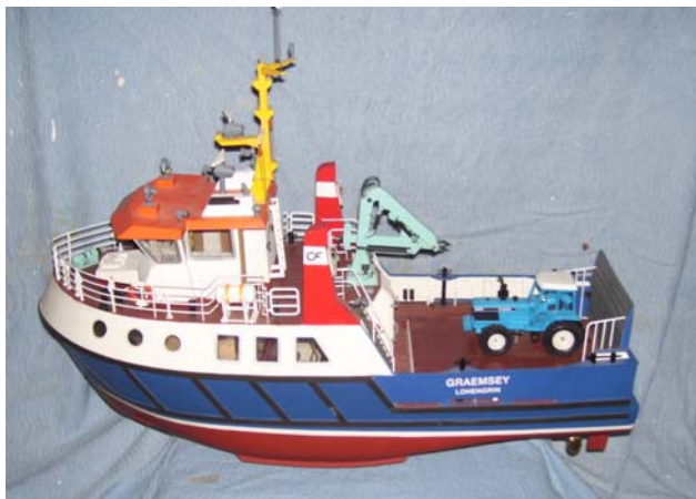
Metcalf Mouldings Island Supply Vessel – GRAEMSEY