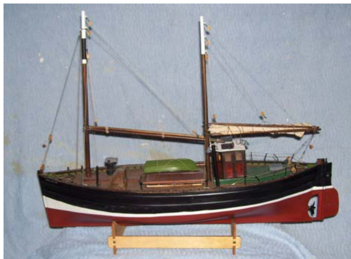
Work Vessel with Salvage Crane