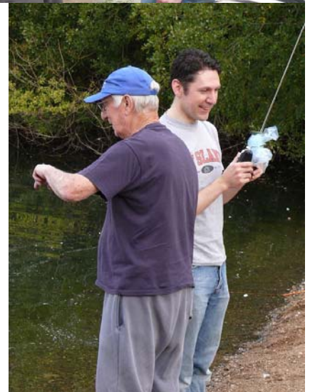
Left hand down a bit!

Well done to everyone, and get those boats ready for 2012.